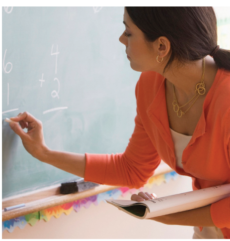
EnvisionIT Education: stretching budgets with straight-A performance.

Konica Minolta is the provider of choice for over 8,000 healthcare facilities across the nation — combining the intelligence of the bizhub MFP design with more efficient ways to digitize and share patient records, while maintaining security to meet HIPAA and AARA/HITECH mandates and reducing operating costs by managing document workflows more efficiently.