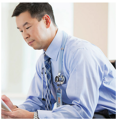
EnvisionIT Healthcare: proven expertise in medical applications.

The bizhub 364e Series gives you a seamless interface with industry standard software for managing case files and preparing information for ECM or eDiscovery offerings. Konica Minolta's own Dispatcher Phoenix Legal software helps you streamline processes such as Bates Stamping, redaction and PDF/A conversion. We are a trusted provider to over 5,000 law firms in the U.S., serving the document and IT management needs with document management and cloud-based solutions that control costs and protect attorney-client confidentiality.